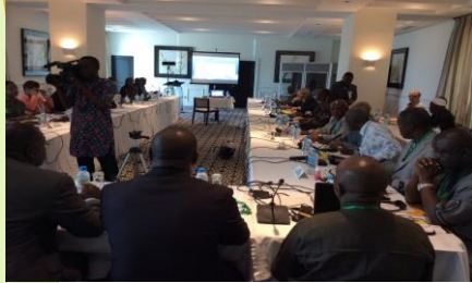
1 st WAC, Guinea, 2015