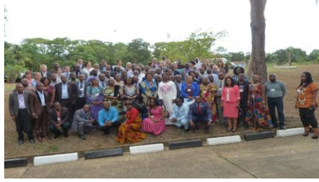
2 nd WAC, Sierra Leone, 2016