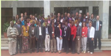
Ethics/Regulatory, Liberia, 2015