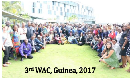
3 rd WAC, Guinea, 2017